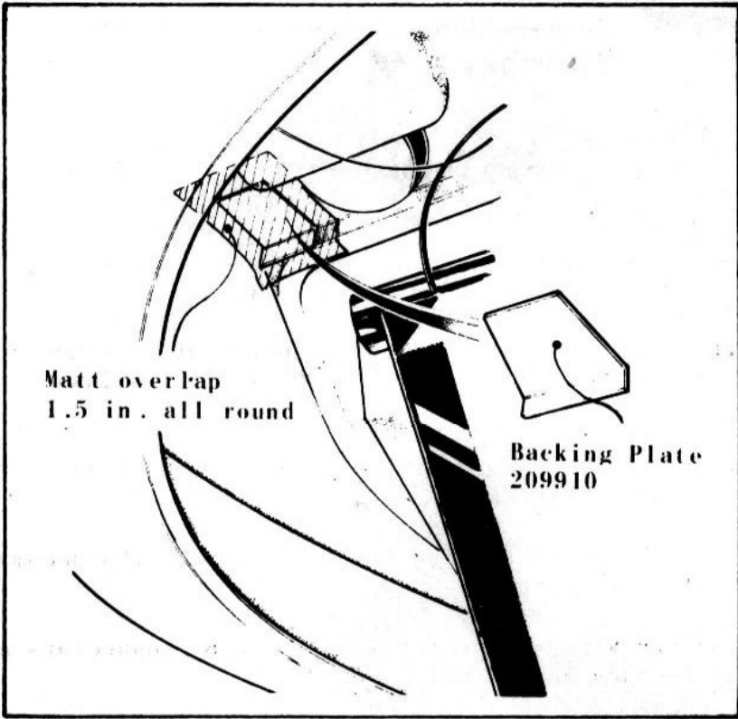
FIGURE 1. Canopy Hinge from under front of body